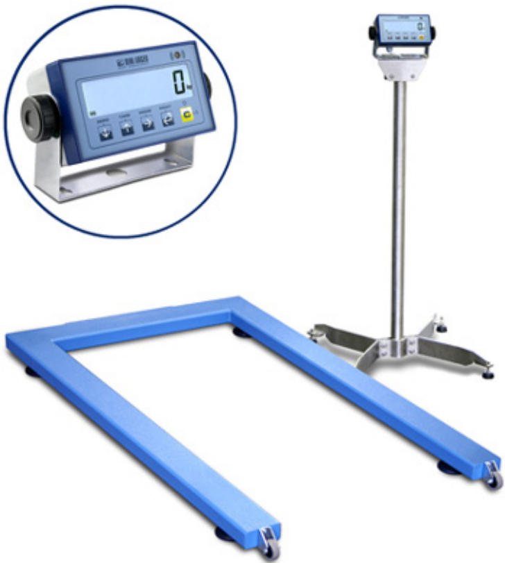
EPWL with optional column

NOTES: weight indicator is suitable for installation on the table, column, wall or attached to the structure.