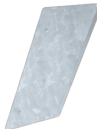
MAX 6 pcs. - 3,5 kg ballasts