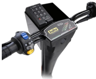
Basket with ON/OFF keypad