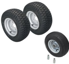
Turf wheels kit