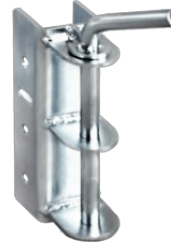
Drop pin hitch Ø16 mm