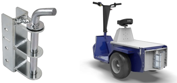
Drop pin hitch Ø20 mm