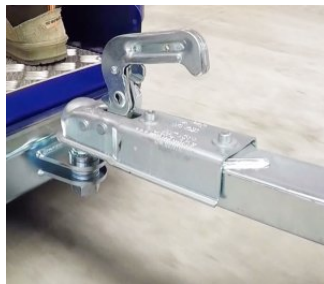
Coupling ball for trailers