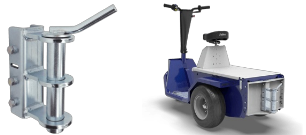
Drop pin hitch Ø35 mm