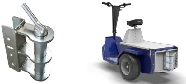
Drop pin hitch Ø40 mm