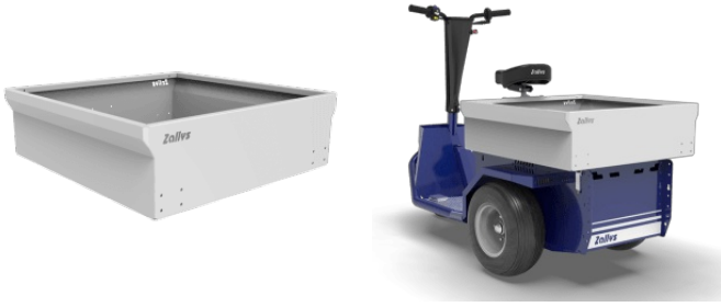
Basket 730 x 730 x 220 mm