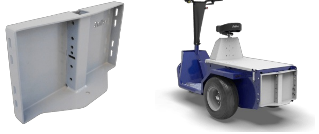
Mounting plate for hitches