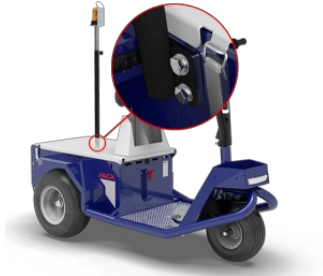
Spacer kit for flashing beacon