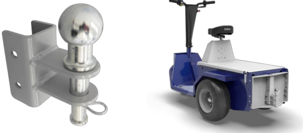
Ball/pin hitch Ø20-25