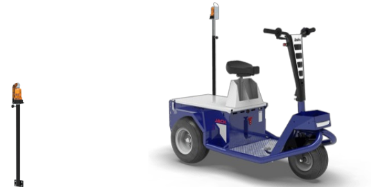
Telescopic pole mounted flashing beacon