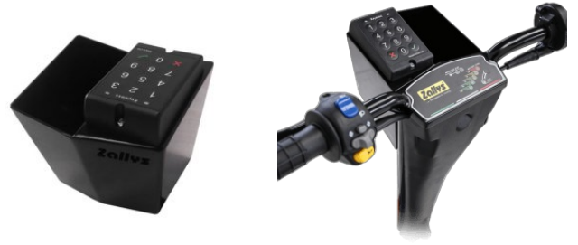
Basket with ON/OFF keypad