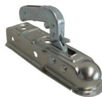
Coupling ball for trailers