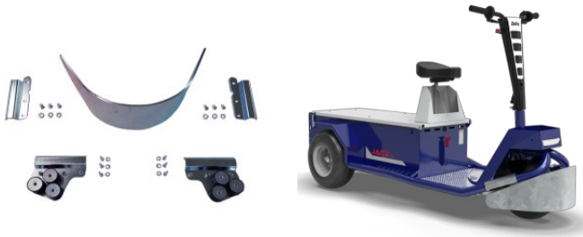
Front bumper kit