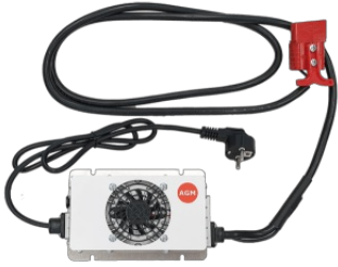
Battery charger (220) 20A 24V