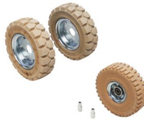
Superelastic non-tracking wheels kit