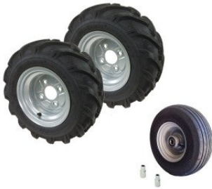
Tractor wheels kit