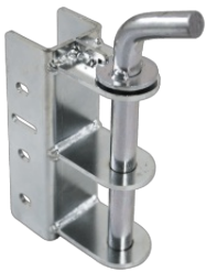
Drop pin hitch Ø20 mm