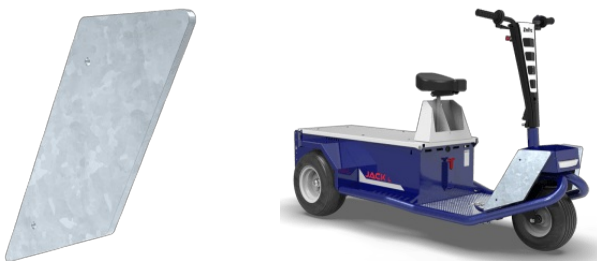
MAX 6 pcs. - 3,5 kg ballasts