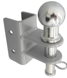
Ball/pin hitch Ø20-25