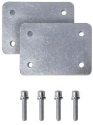
Spacer kit for flashing beacon