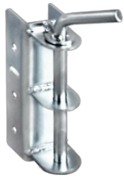
Drop pin hitch Ø16 mm