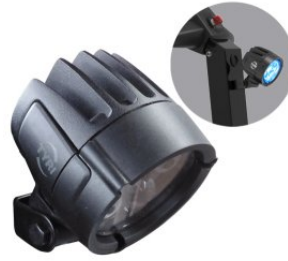
Blue LED light kit FRONT