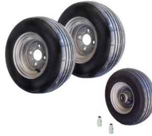
Ribbed wheels kit