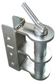
Drop pin hitch Ø40 mm