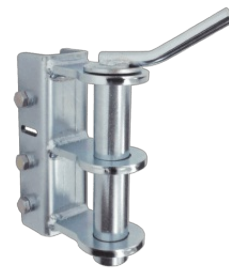
Drop pin hitch Ø35 mm