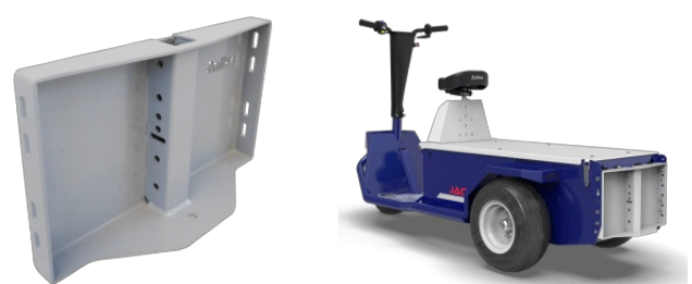
Mounting plate for hitches